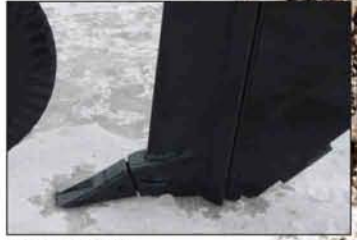
KNIFE POINT Replaceable hardened-steel knife point is designed to disrupt the soil upward for easier pulling and proper silt fence installation.