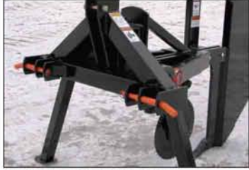
CAT. I AND II HOOKUP PINS Cat. I and II hookup pins for easy 3 point hookup or quick attach skid loader mounting plate for easy mounting.