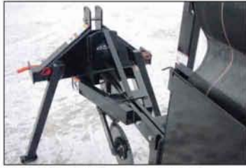
TUBE STEEL A-FRAME DESIGN Tube Steel A-frame design with 1" stringers