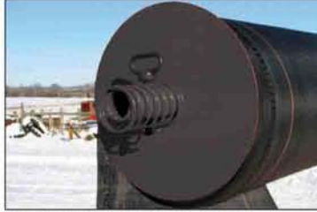
FABRIC TENSION SPRING AND 16" DIAMETER FABRIC PLATES Simple easy to adjust fabric tension spring allows for quick adjustment. 16" Diameter fabric plates prevent the fabric from telescoping over the plates during installation.