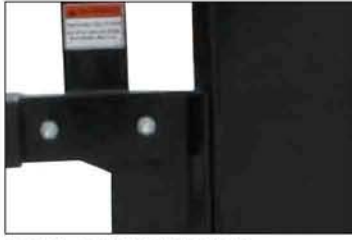
SHEAR BOLT PROTECTION Shear bolt protection with hardened bushing for plow blade