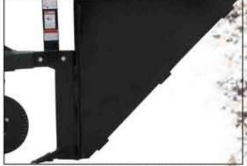
UNIQUE POSITIVE FEED DESIGN of the silt fence plow allows silt fence to be installed in a fast, tight and effective manner. Stainless steel in the key wear areas of the fabric chute ensure low maintenance.