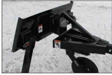
FRONT PIVOT Simple front pivot allows for tight turns.