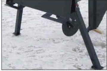
RETRACTABLE LEGS Retractable legs positioned at an angle keep the machine stable when unhooked.