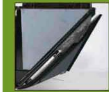
FC-1136 36" FABRIC CURTAIN The fabric curtain is a plastic divider that separates the fabric so it does not rub against itself when going through the fabric chute. It is only needed when using non-woven fabrics to prevent the fabric from grabbing itself and pulling down. With slick woven fabric, the divider is not needed.