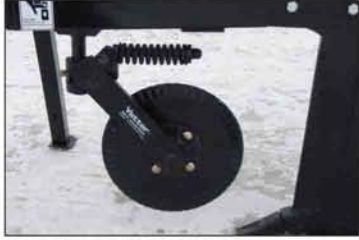
SPRING-LOADED COULTER Standard spring loaded, hardened-steel 16" diameter fluted coupler cuts through tough soil, tree roots and vegetation.